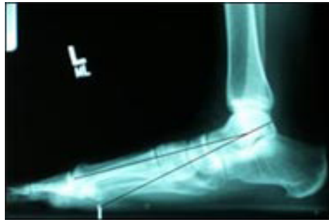
Fig.E: X-Rays of Acquired Flat Foot Deformity

Typically, the surgical procedure consists of two major steps including repair of the tendon and realignment of the hindfoot. The ideal scenario is to reconstruct the normal resting length of the tendon primarily by adding a new tendon to strengthen the damaged tendon. Most often, a flexor tendon of the toes is harvested for this purpose.