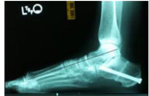
Fig.F: X-Rays After Reconstruction

The second stage of realigning the hindfoot may be done by reshaping the heel bone and moving the heel toward the inside to re-establish its position to be more closely aligned with the leg (Fig. D). Post operatively the X-rays should demonstrate restoration of the alignment of the foot (Fig. E & F).